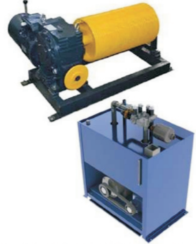
DRUM / HYDRAULIC