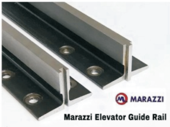
ELEVATOR GUIDE RAIL